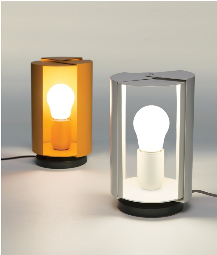
Table lamp with a cylindrical body, open on two sides, on which two diffusers rotate and allow the opening and closure of the lighting beam, in order to adjust the light in a direct or indirect way. Base in steel painted in matt grey, body in rolled metal sheet painted in white, yellow and matt grey. Switch on cable.