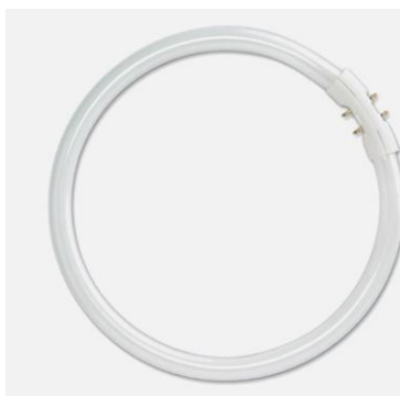
LUMILUX® T5 FC®